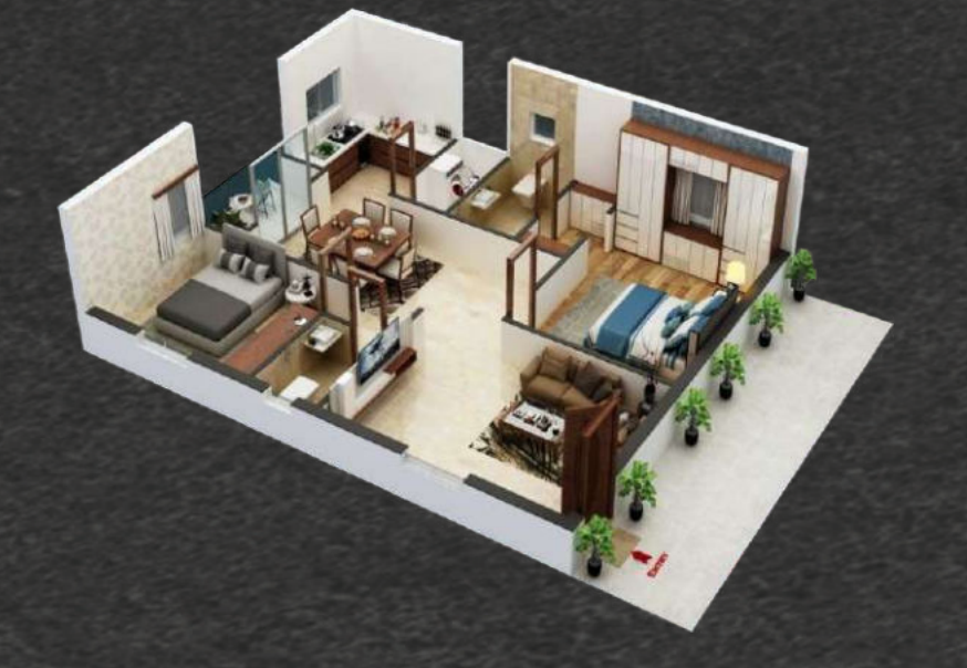
East Facing 2BHK 1185 SFT